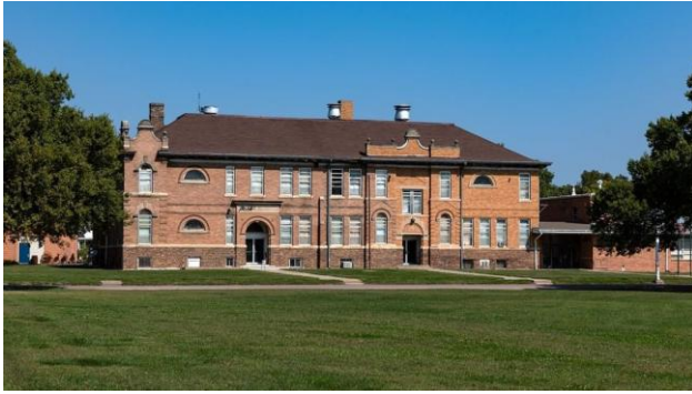
The School Building